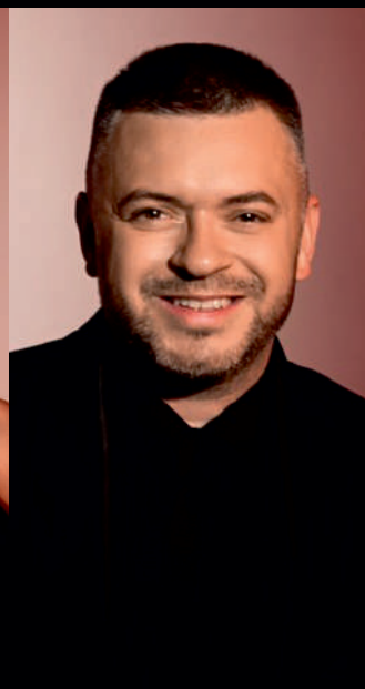
YARIK VOCAL & MANAGEMENT